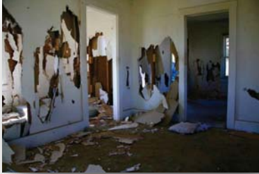
Malicious Damage Guarantee