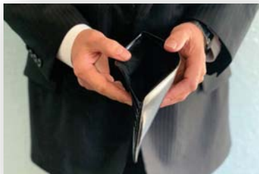
Loss of Rent Guarantee