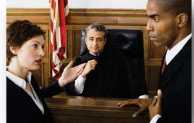
Eviction Cost Guarantee